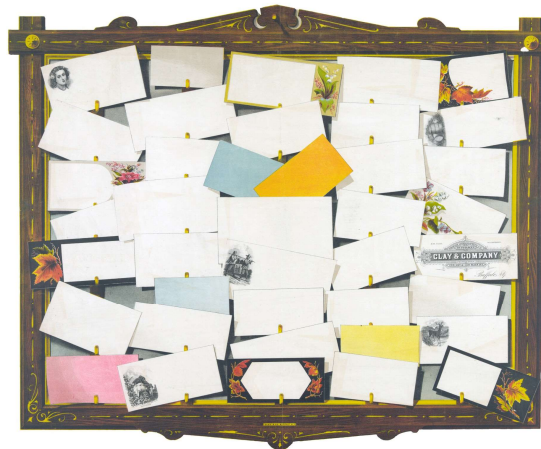
Provide Information on Woodworking Technology and Wood Price