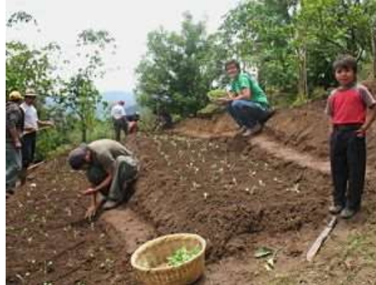
Consultation Harvest Plan and Afforestation